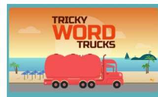
Tricky and High Frequency words